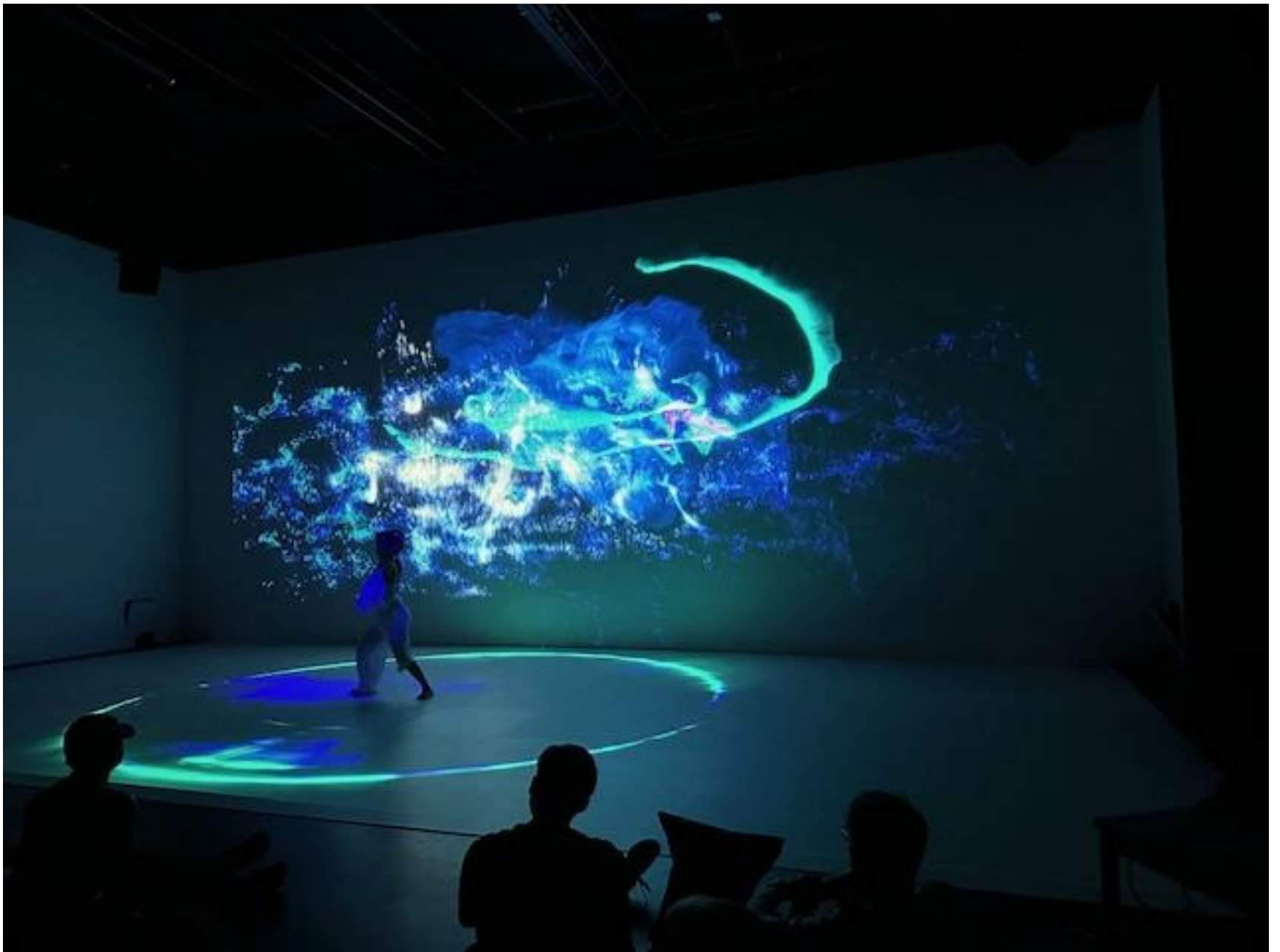
Ars Electronica Linz 2024