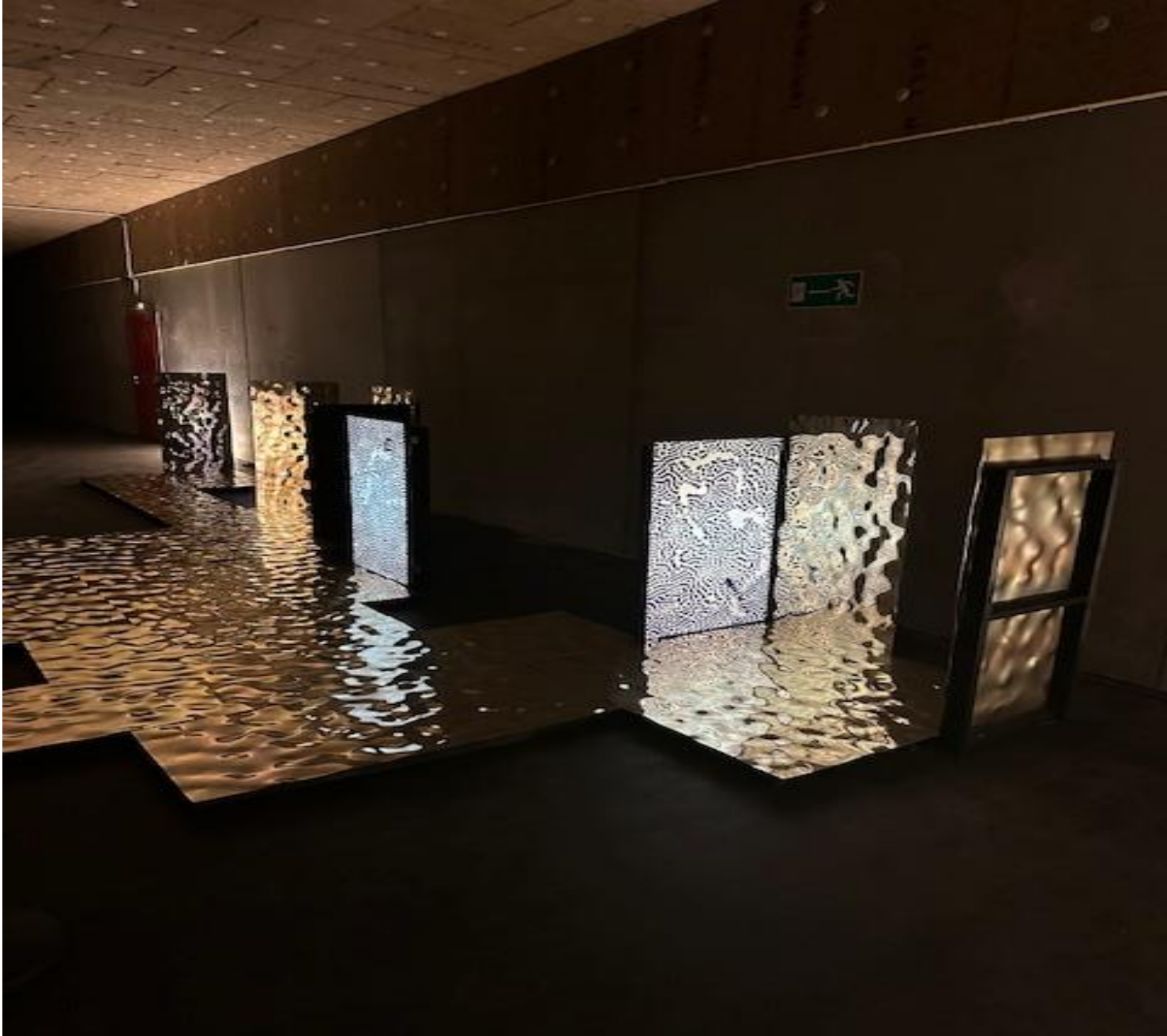
Ars Electronica Linz 2024