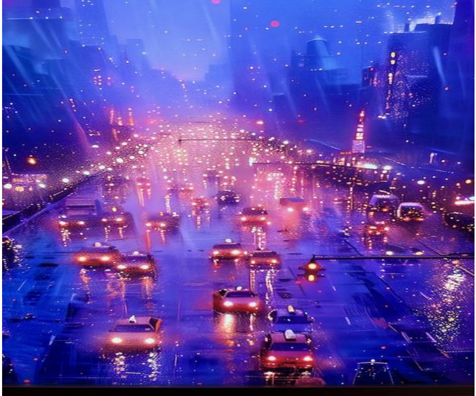
Ars Electronica Linz 2024