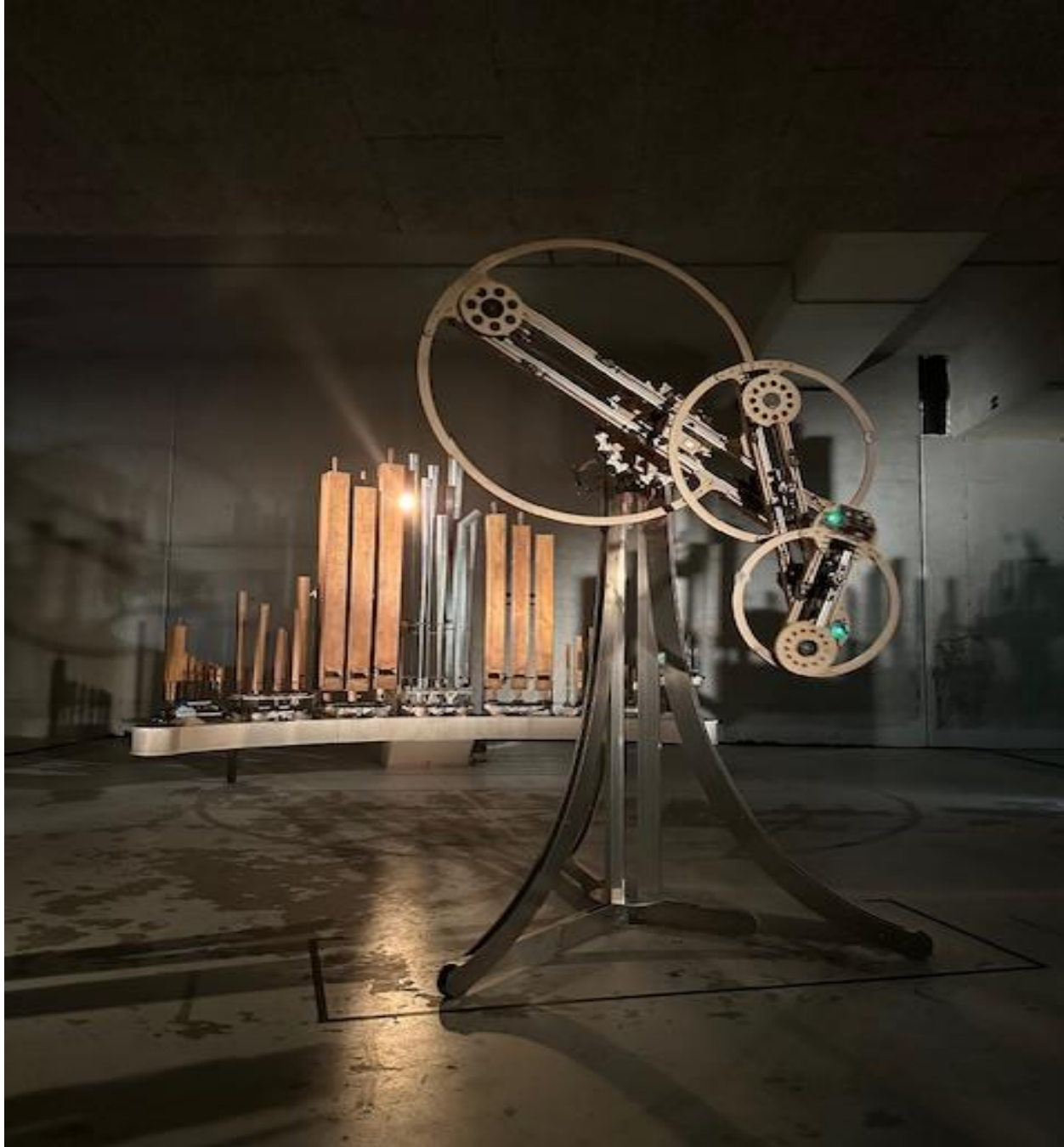
Ars Electronica Linz 2024