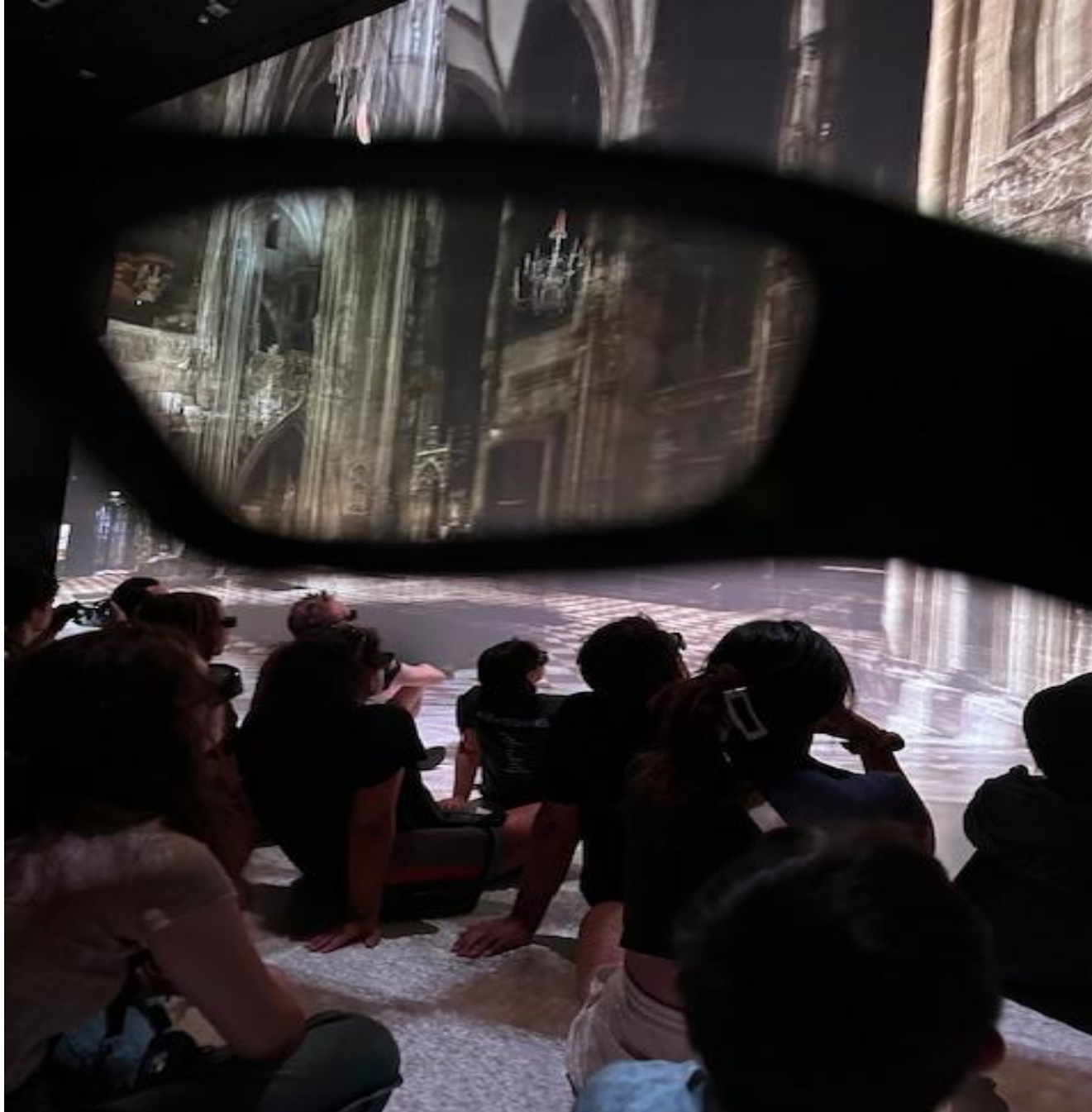
Ars Electronica Linz 2024