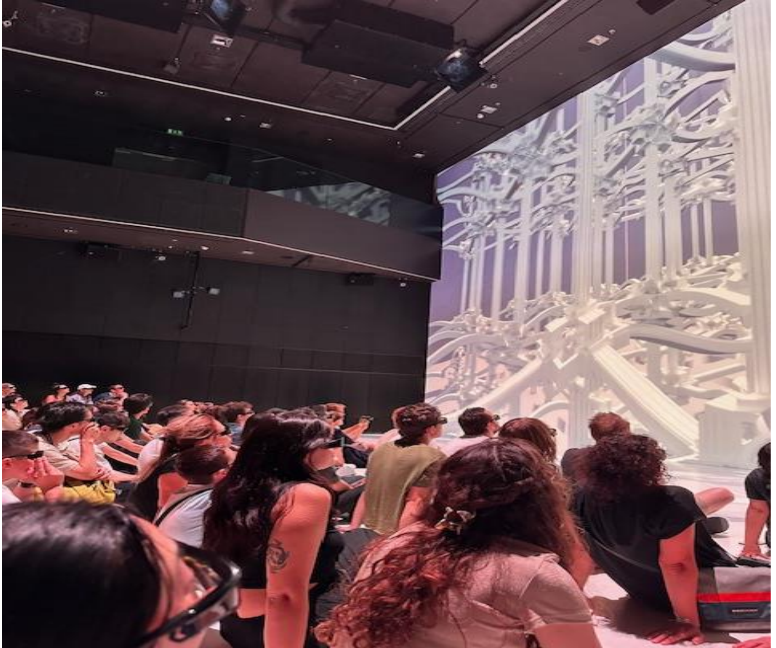
Ars Electronica Linz 2024