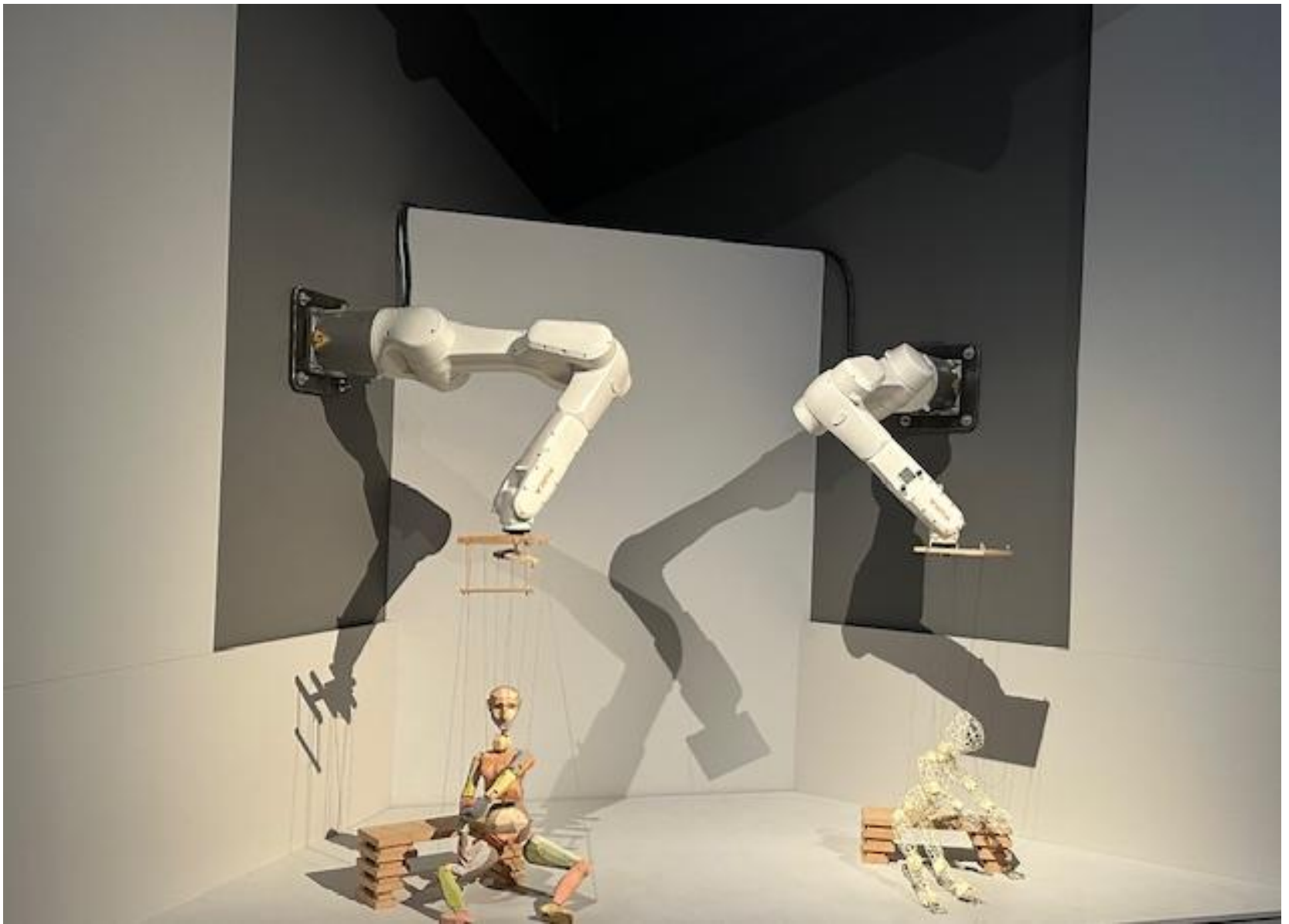
Ars Electronica Linz 2024