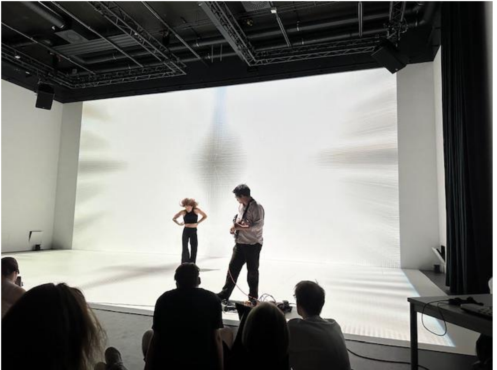
Ars Electronica Linz 2024